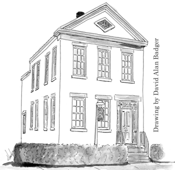
Drawing by David Alan Badger

Times change, and Mulholland Street's commercial activities continue to evolve. Wouldn't it be fun for merchants from the past to take the tour, compare the similarities and contrast the differences! From a town of 12,000 to one that's hovered near 1,000 over the past 100 years, there would be a whole lot of changes to mull over.